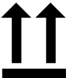
This Way Up thiswayup.bmp