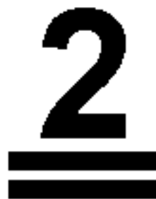
Maximum Stack (2 shown) Maxstack2.bmp (thru 8)

Please enquire if you require other symbols.