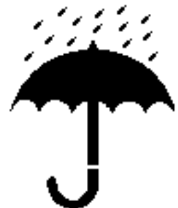
Keep Dry keepdry.bmp