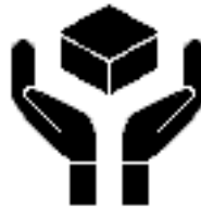
Handle With Care handlewcare.bmp